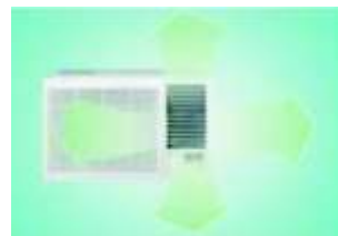
4-Way air Deflection

Johannesburg Toll Free: 0800 54 54 54 Cape Town: 021 534 7950 Durban: 031 716 5454